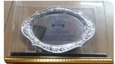
Proud Recipient of Industrial Academia Conclave Award- 2017

Bankura Unnayani Institute of Engineering is participating in TEQIP II under Sub-component 1.1 with the objective of strengthening institutions to produce skilled manpower of the highest quality comparable to the very best in the country and in adequate numbers to meet the complex technological needs of the economy.